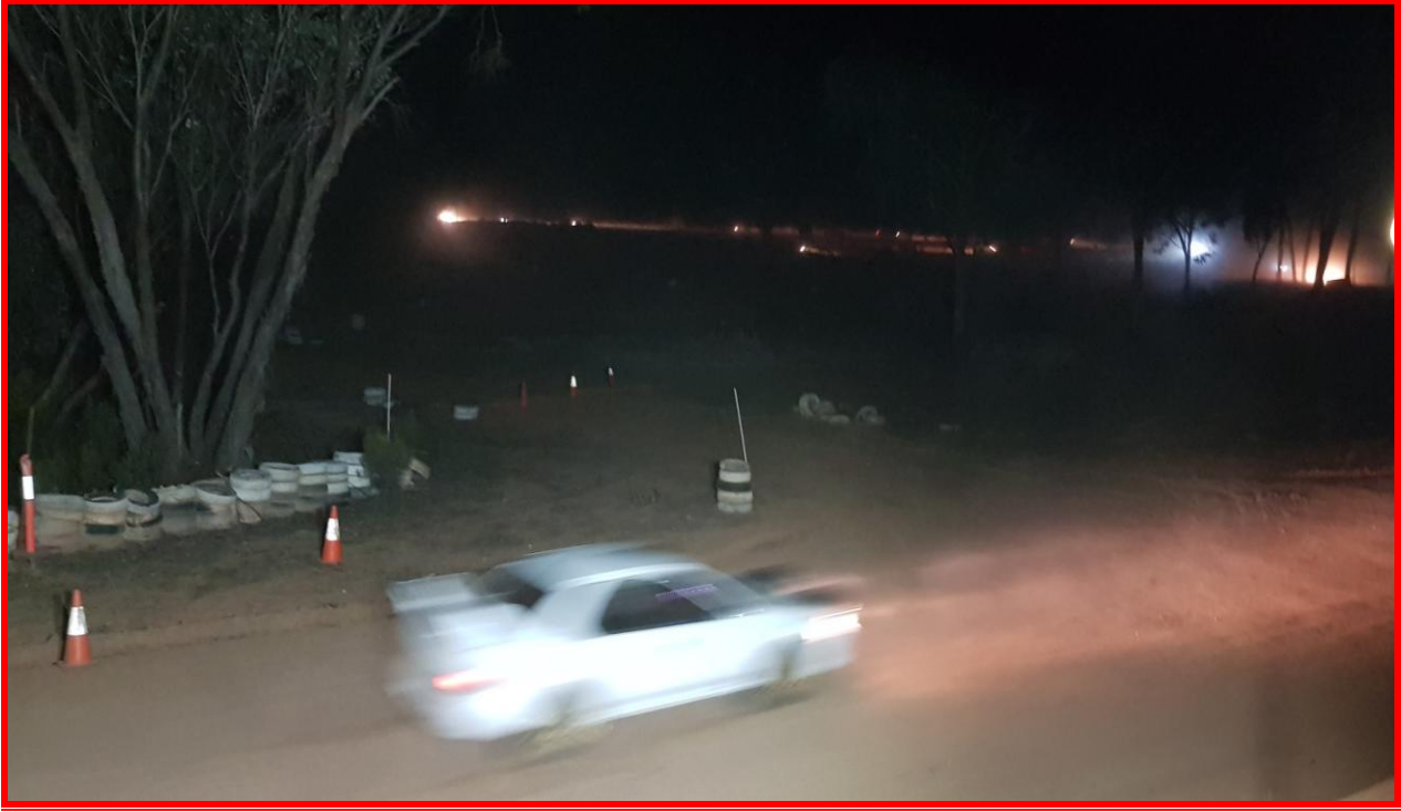
A great sight, as drivers do their night recce.