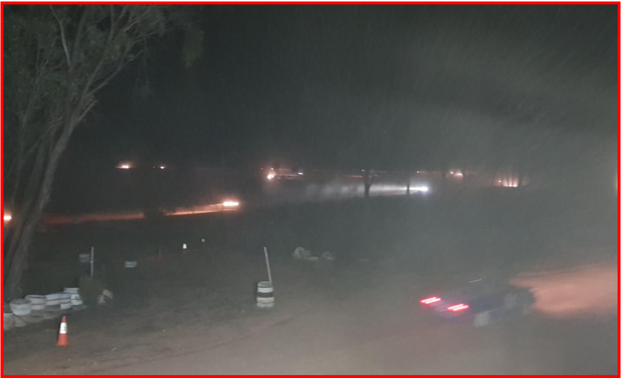
Like snow skiers at season opening.